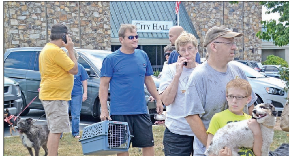
A couple dozen residents attended the Fall Rabies Clinic with their pets on Saturday, Sept. 17 The clinic was sponsored by local pet organization PUP, for Prevent Unwanted Pets.