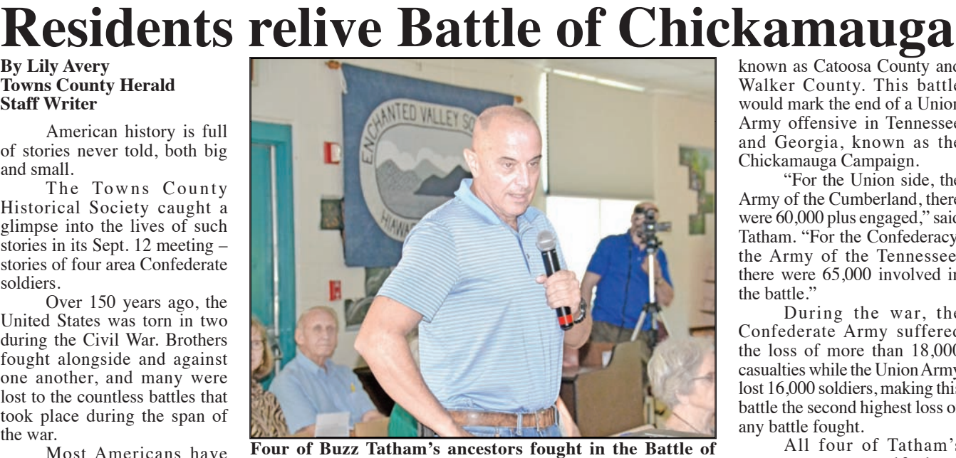
Chickamauga. He talked about these ancestors at the September meeting of the Towns County Historical Society.

"The one thing I've learned about history over the